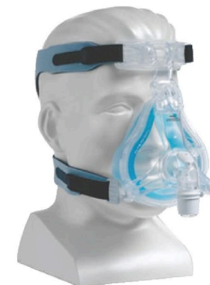
Bi - PAP Face Mask