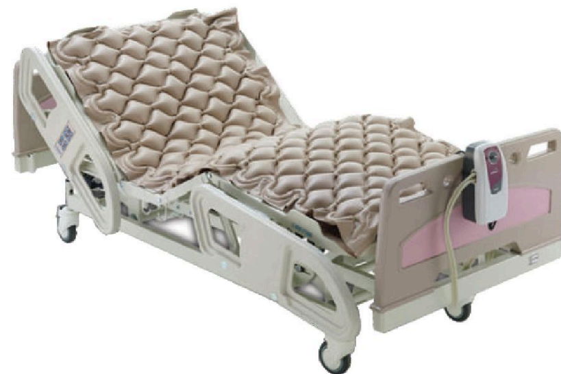
Nimbus Mattress Bubble Type