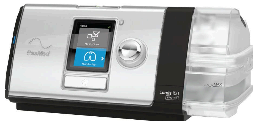
Bi - PAP